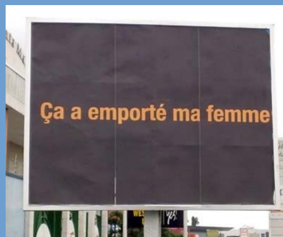
Cote d'Ivoire billboard reads "It took away my wife."

Especially for messaging that involves story telling (e.g., films, radio shows or television), communicators should take care in ensuring