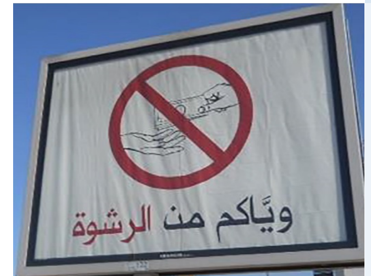
This Morocco billboard says “Beware of bribes.”

Relatedly, the credibility and trust an audience has in the person or organization delivering a message is also important. Research on messaging campaigns designed to tackle other ‘social bads’ confirms that audiences are more likely to pay attention to and believe messaging delivered by a source they judge to be credible (e.g. Maclean, Buckell, & Marti, 2019). For messaging campaigns delivered or sponsored in some way by the government, this of course means that citizens are more likely to respond as intended when the government has made a credible commitment to challenge the corrupt status quo, as discussed above. The critical public reaction to the previously mentioned “Change Begins with Me” campaign in Nigeria helps to underscore this point. The first anti-corruption messaging campaign deployed