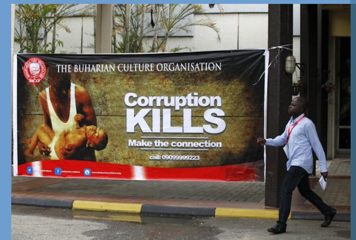
Buharian Culture Organisation signage in Nigeria

Corruption is often argued to be one of the biggest threats to both development and democracy around the world. This helps to explain why anti-corruption campaigns have been a constant feature of both foreign aid programming and civil society activity over the last 30 years. These anti-corruption campaigns usually have an awareness-raising component that involves producing messages about the harm that corruption can do to a mass audience. This is understandable as such messaging is one of the few tools policy makers have to try to influence the types of popular attitudes and behaviors that can sustain corrupt practices and frustrate anti-corruption efforts. Harnessing public opinion also promises to be an effective way to put pressure on political leaders and bureaucrats, and hence to promote broader reforms and practices that reduce the level of graft. There is growing concern, however, that