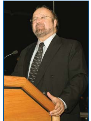
Hernando de Soto, ILD President

This groundbreaking approach made it possible for the ILD to help defeat the Shining Path terrorist movement in Peru and the guerrilla movement in El Salvador. The Shining Path's own newspaper, El Diario , declared that the ILD's methods hindered recruitment efforts and weakened popular support for the terrorist cause.