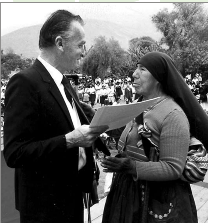
As a result of ILD's years of hard work, home owners, like the woman above, received official titles to their property, integrating them into the formal economy and institutionalizing the value of their holdings.

“In 1984 the Center for International Private Enterprise and the National Endowment for Democracy offered early support to pioneering reforms