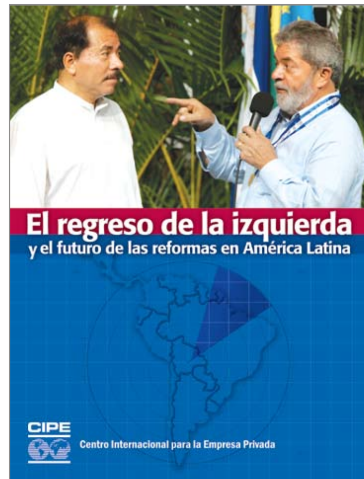
COSEP was highlighted in the CIPE publication, El regreso de la izquierda y el futuro de las reformas en América Latina (The Return of the Left and the Future of Reform in Latin America), for its work on a National Business Agenda and advocacy and policy reform in Nicaragua. Pictured above are President of Nicaragua Daniel Ortega, left, and President of Brazil Luiz Inácio Lula da Silva, speaking at a CIPE-sponsored investment forum for the two countries.