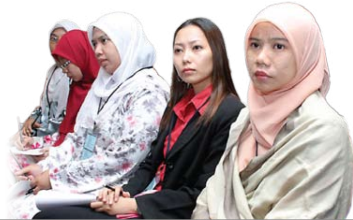
ADFIAP's conference in Malaysia helped participants better understand corporate governance implementation.

This project won a 2008 Associations Make a Better World Award from the American Society of Association Executives and The Center for Association Leadership. The award has drawn public attention to ADFIAP's work, including a story on ADFIAP's achievements in promoting corporate governance in The Philippine Star , a leading English-language daily with a circulation of about 268,000.