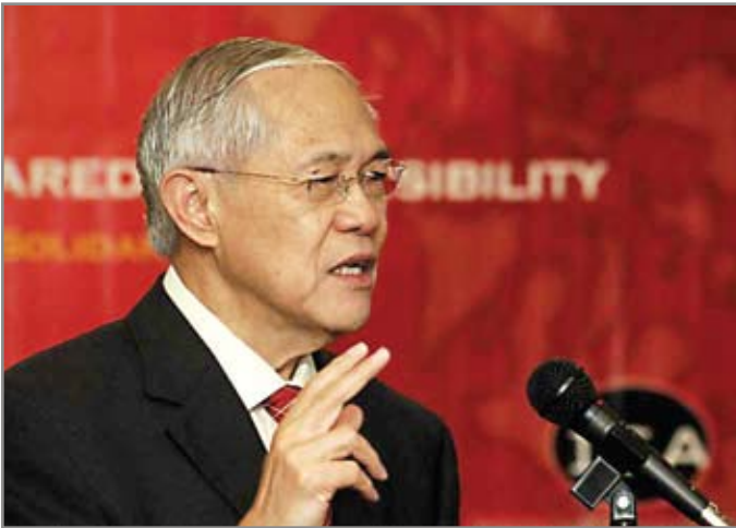
ISA Chair Jesus Estanislao speaks on the shared responsibility of government and citizens in making improvements to local governance institutions.