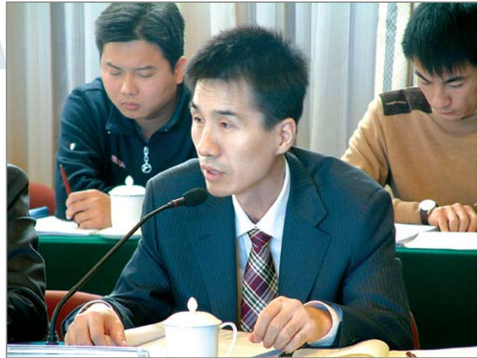
Unirule's survey of public governance has prompted discussion of local governance issues and how to address them.

Perhaps the most engaging of Unirule's activities are its twice-monthly symposia on crucial reform issues. Topics have included "Civil Society in China," "A Road Map for Democratization in China," and "The Challenges of Land Tenure Policy in Urban Areas." In contrast to the typically small and academically-oriented symposia normally held by Chinese think tanks, Unirule's symposia are open to the public and attract participants from government agencies, the private sector, and the media,