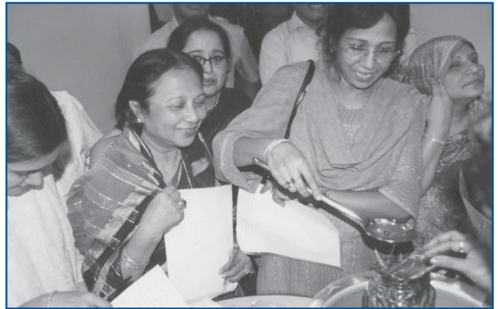
Participants package local produce at DCCI agro-processing workshop.

On June 29, 2005, DCCI organized a workshop with the Agro-based Industries and Technology Development Project (ATDP) on "the Preservation and Packaging of Agro-Processing Products." The discussion targeted a segment of entrepreneurs that DCCI is particularly focused on helping: women. To date, DCCI's Women Entrepreneurs Development project has provided technical know-how on a variety of sectors in more than 30 workshops. With support from CIPE, DCCI has held more than 40 policy roundtables for its general membership on topics ranging from exporting opportunities and small business marketing tips to business and infrastructural development. So far, more than 600 women have participated in DCCI workshops, and local media are taking notice. The workshop was featured on the